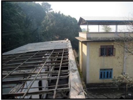
Removal of roof & ceiling